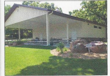
Tecumseh Park Shelter